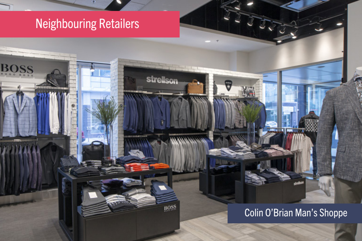
Colin O'Brian Man's Shoppe