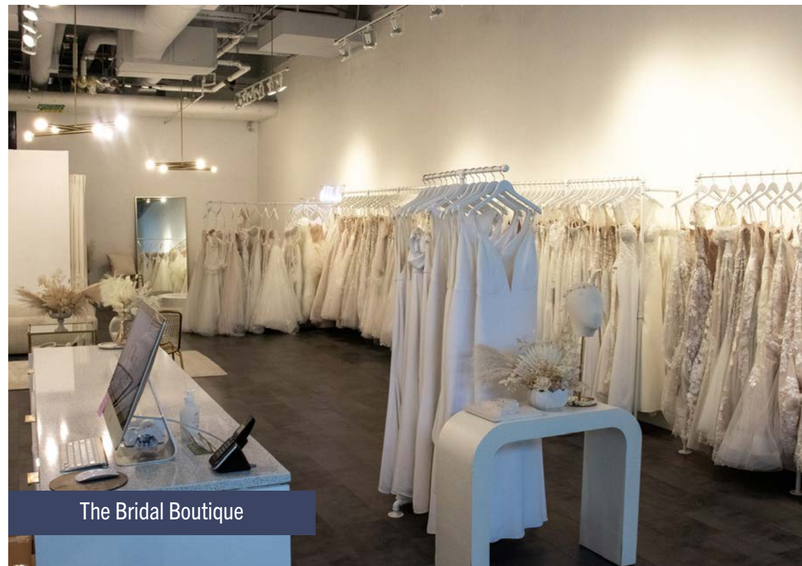
The Bridal Boutique